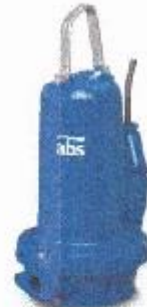
ABS submersible grinder pump Piranha PE Part of the ABS ETeX range